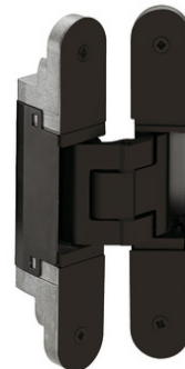
CONCEALED HINGES - TECTUS 340D - TECTUS 540D