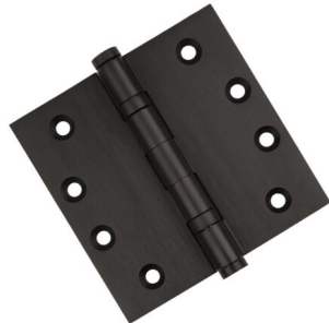
COMMERCIAL (1279) BALL BEARING HINGES - US10B OIL RUBBED BRONZE - US19 BLACK FINISH - OTHERS