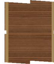
SQUARE GROOVE 1/8"W X 1/16"D